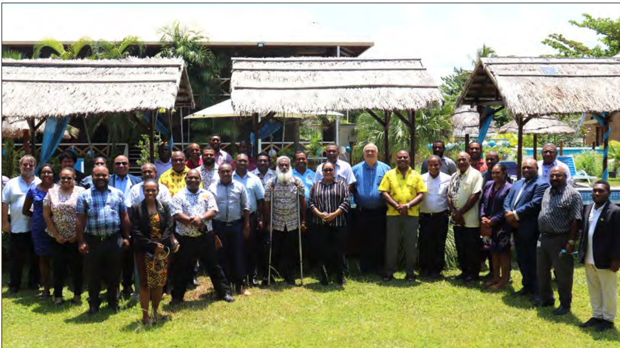
Photo 6: First National Coordinating Committee (NCC) on AML/CTF held outside of Port Moresby in Kokopo, East New Britain Province (ENBP) in October 2021.