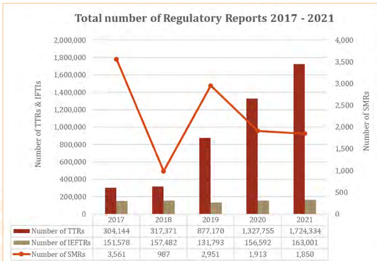
Chart- 1 - Total number of Regulatory Reports received from 2017 - 2021

Source: Financial Analysis and Supervision Unit