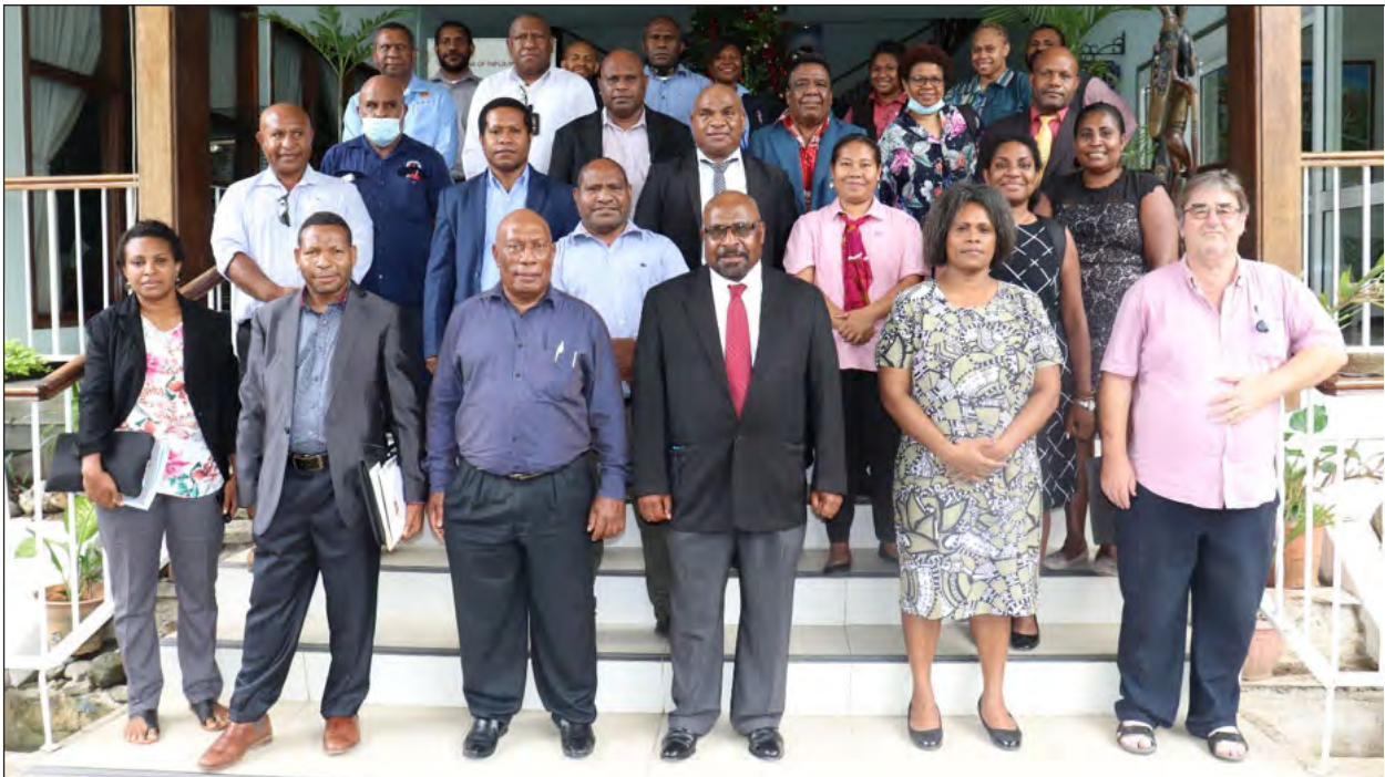
Photo 9: Final NCC on AML/CTF Meeting for 2021 held at Madang Resort Hotel, Madang in December 2021.