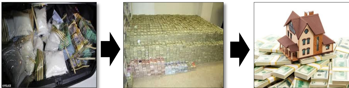
Crooks sells drugs for cash